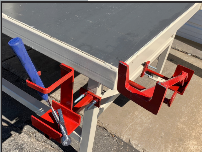
Hammer and Pallet Dismantler Holster