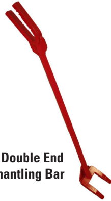
PRS Double End Dismantling Bar