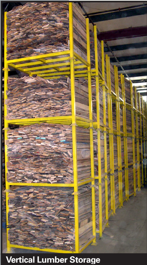
Vertical Lumber Storage