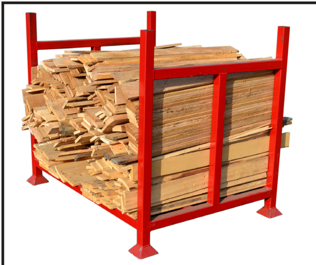
Lumber Rack with optional T brace sides

Rack King Lumber Racks are nothing like anything you've tried before. These material handling marvels will save you many unseen costs such as building wooden bins, repairing broken bins, and restacking lumber from broken bins. Utilize vertical storage in your warehouse with these stackable racks. Stack up to 4 units high and save valuable floor space. Rack King Lumber Racks make organizing your lumber storage easy.